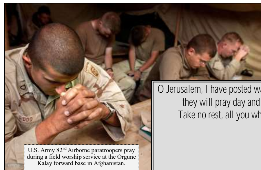
U.S. Army 82 nd Airborne paratroopers pray during a field worship service at the Orgune Kalay forward base in Afghanistan.

O Jerusalem, I have posted watchmen on your walls; they will pray day and night, continually. Take no rest, all you who pray to the LORD.